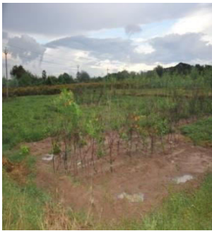
a) Under open