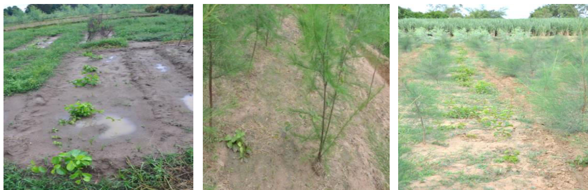
a) Under open b) Under C. equisetifolia c) Under C. junghuhniana

The significant difference was found among the root length, shoot length and girth of D. hamiltonii and H. indicus under different agroforestry trial. Maximum root length, shoot