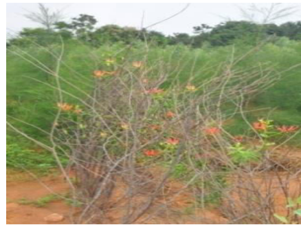
c) Under C. junghuhniana