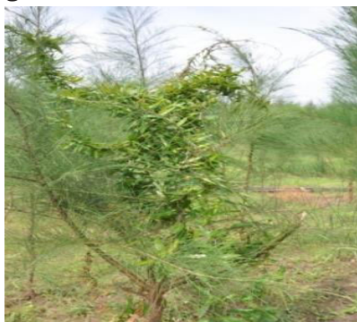
a) Under C. equisetifolia