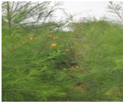
b) Under C. equisetifolia