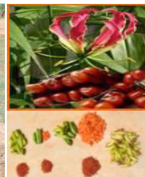
c) Gloriosa superba seeds