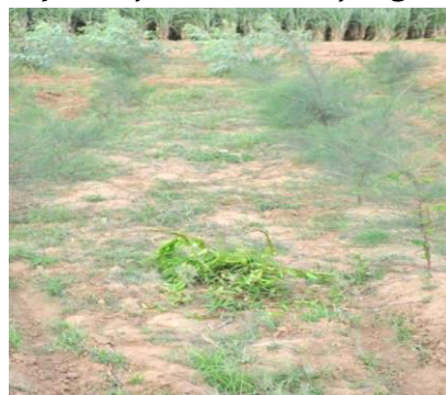
b) Under C. junghuhniana